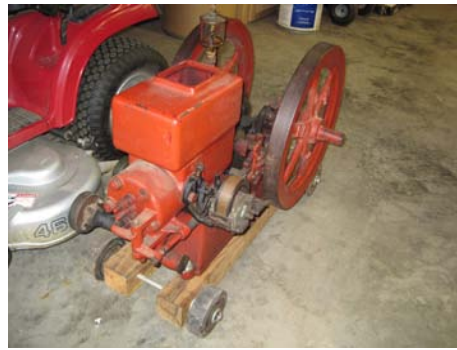
3 HP Hit and Miss engine