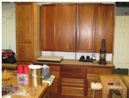
Mahogany cabinets and a beer bottle radio