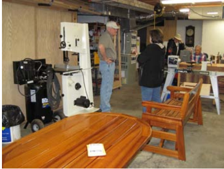
A view of Brian's shop