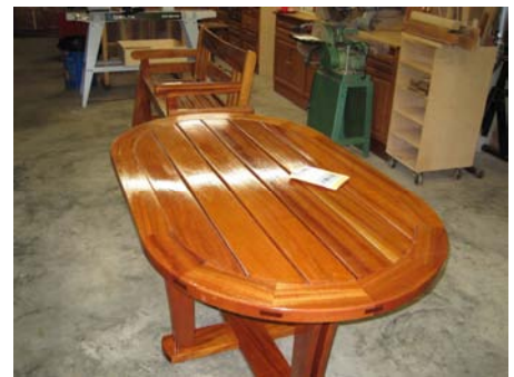
Patio table and glider by Brian Stauss