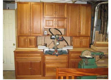
Chop saw station.