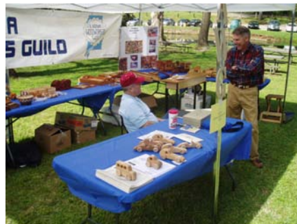
AWG Tents at the Montevallo Art Fest