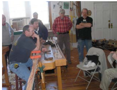
AR has their full attention.