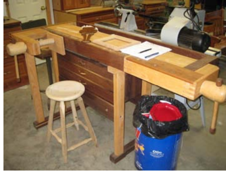
Baker Bench and Delta Lathe